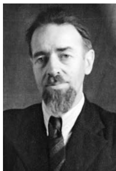
Nikolai Bernstein (1896–1966)

One of the most influential scientists of the twentieth century, a corresponding member of the Academy of Medical Sciences, Doctor of Medical Sciences, Professor Nikolai Bernstein laid the foundations of modern biomechanics and human motion control theory. Nikolai worked in